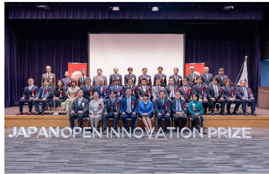
Photos of the Award Ceremony