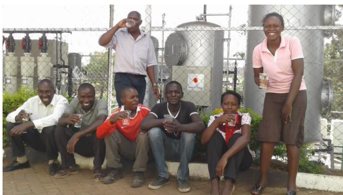
Residents in Kenya appreciated treated water

Climate change has caused seawater intrusion due to declining river levels in dry seasons and high turbidity of surface water due to prolonged rainy season in countries such as Kenya and Myanmar. MCAS has promoted measures to treat such unstable water sources and supply safe drinking water using its water treatment technology. As for operation and maintenance of the water treatment systems, MCAS not only transferred technology to local staff, but also has established a system to monitor and provide technical support from Japan by utilizing a remote monitoring system.