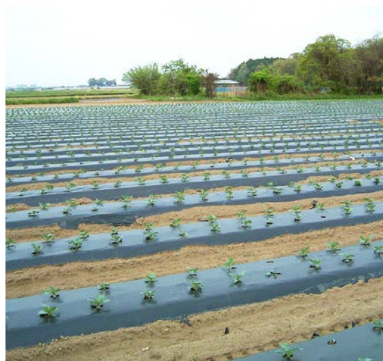
Use in agricultural mulch films

Agricultural mulch film is used to cover the rows of soil in which agriculture products grow, helping prevent insect and weed infestation, stabilize ground temperature, maintain soil moisture and prevent fertilizer runoff. Because of the wide range of useful effects they offer, such films are in widespread use. However, after crops are harvested, ordinary mulch films must be collected from the fields and disposed of as waste plastic or incinerated. The biodegradability of BioPBS™ is thus of great use in this application. Agricultural mulch film made with BioPBS™ need not be collected after the harvest, and can instead simply be plowed into the soil, where it naturally breaks down. This helps achieve sustainable production, part of one of the SDGs, while contributing greatly to labor saving in agriculture.