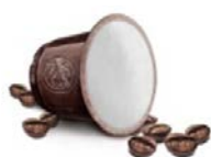
Use in a coffee capsule

Capsule coffee makers have rapidly grown in popularity in recent years. These machines heat water at high pressure then force it through the ground coffee beans, which are kept fresh inside a capsule, to brew coffee. For this to work, the capsules need to have a number of attributes, including heat resistance, impact resistance and sealability to preserve flavor. Because it meets these needs, BioPBS™ is used as a material for coffee capsules.